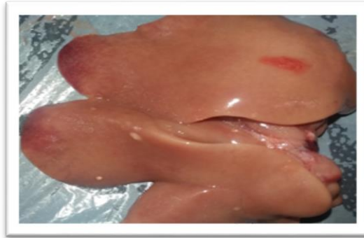
Fig. (1) liver of freshly dead birds with white necrotic foci on the surface.