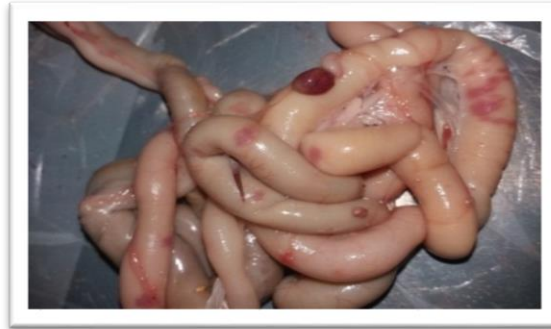
Fig. (2) Intestine of freshly dead birds with haemorrhagic patches, bloody unabsorbed yolk sac and petechial hemorrhage of the intestinal mucosa.