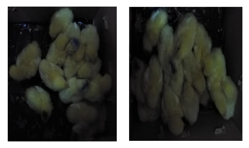
Fig. (1) Huddling together and ruffling chicks showing depression, feather after intratracheal and intravenous inoculation with E.hirae in experimentally infected chicks