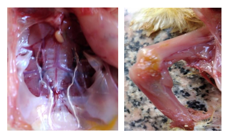
Fig.(6) Congestion of the kidney and Fig.(7) Gelatinous material on the ureters filled with urates