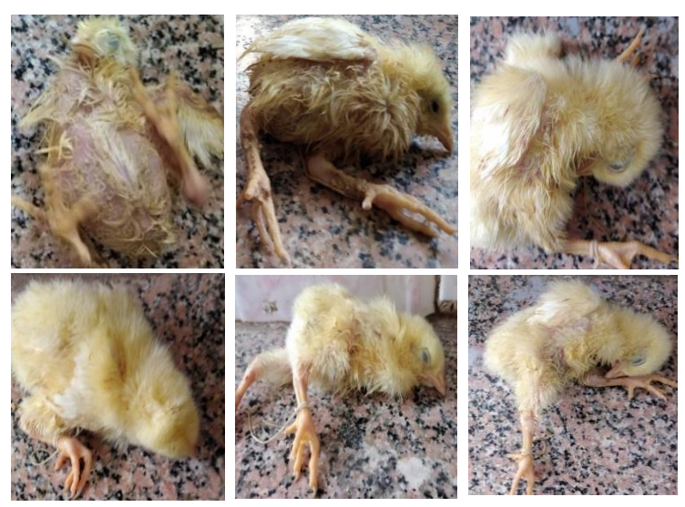
Fig. (3) Nervous signs in experimentally infected chicks

Fig.(2) Locomotors disturbance in experimentally infected chicks