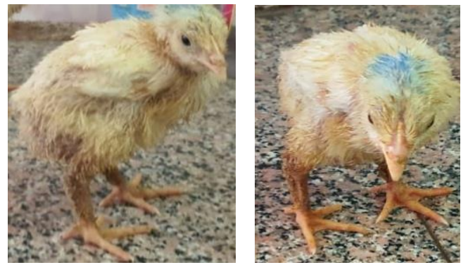
Fig.(2) Locomotors disturbance in experimentally infected chicks