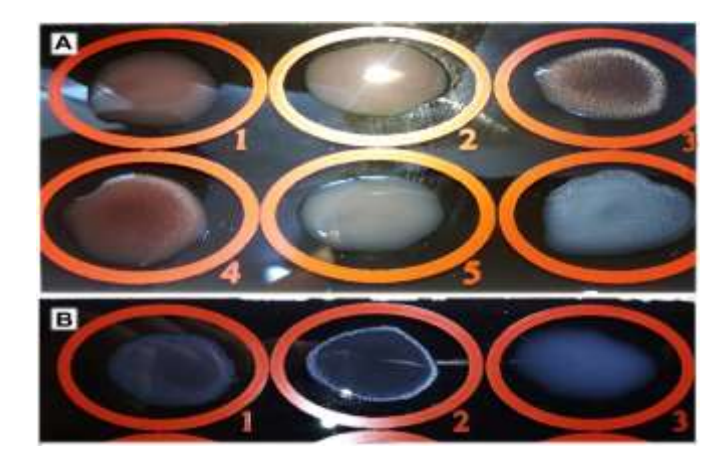
Plate (1): (A): Latex Agg. Test of meat juice showing positive agglutination reaction (circle 3, 4 and 6) while circle (1, 2 and 5) were negative.

(B): Latex Agg. Test of mice bioassay sera showed positive reaction (circle 1) for (Treatment I) and circle (2) for (Control positive), while circle (3) was negative corresponding to Treatment II group.