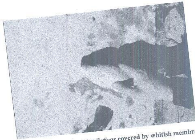
Fig. 2: Eye of Oreochromis niloticus covered by whitish membrane