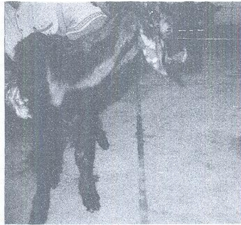
Fig. (5): A kid showing lesions before treatment.