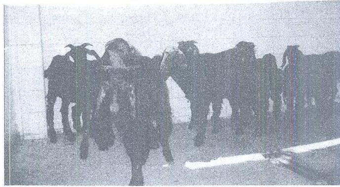
Fig. (4): A group of kids showing lesions of ringworm.