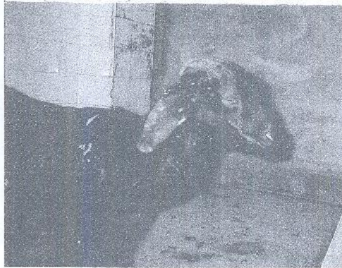
Fig. (6): A kid after two weeks of treatment.