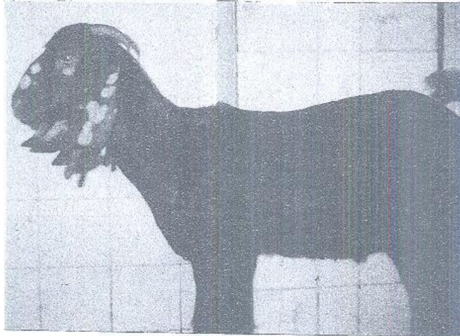
Fig. 1: A kid showing circumscribed circular lesions in the face and external ear.

Willis, I.B. (1960): The determination of metals in blood serum by atomic absorption spectrophotometry. Spector. Chem. Acta, 16: 259-272.