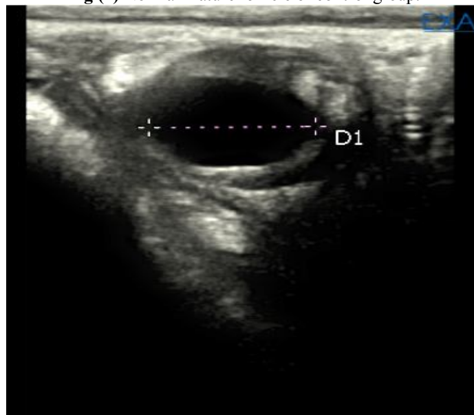
Fig (2) Normal mature follicle of control group.

Follicular Observations based on ultrasonography, in cows with cysts in cows received contaminated ration with zearalenone and aflatoxins. Mean diameter of cystic structure (42.3±1.50 mm), cows exhibit “constant”estrus (nymphomania).