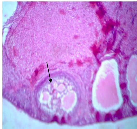
Figure (B) Figure (A)