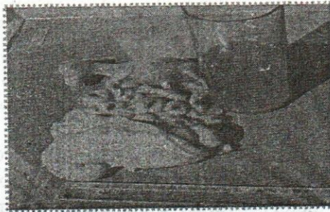
Fig. 3: Incised uterus from a pregnant goat (Fetus located in the right horn)