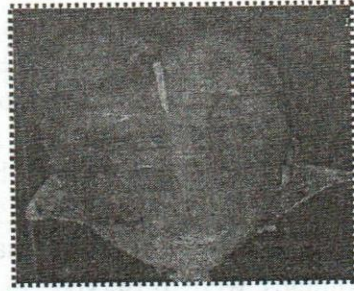
Fig. 2: Gravid uterus.